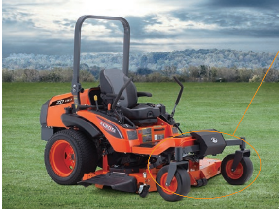
Zero-Turn Mower ZD 1500 series

A Zero-Turn Mower cuts grass with an implement called a mower. The mower, composed of blades and a mower deck surrounding the blades, mows the grass by rotating the blades at a high speed to vacuum and raise the grass. The mowed grass is released from the outlet and scattered uniformly on the farmland.